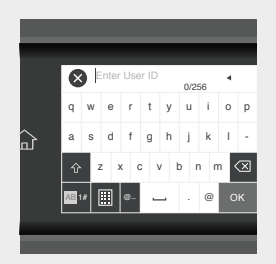
User ID & password