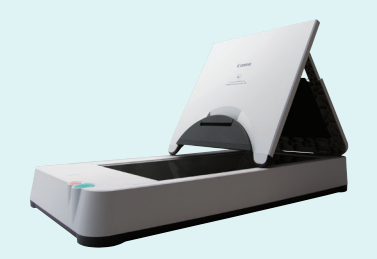
A4 Flatbed Scanner Unit 101

Scan bound books, journals and fragile media by adding the Flatbed Scanner Unit 101 for documents up to A4 or Flatbed Scanner Unit 201 for A3 scanning. Connected by USB, these flatbed scanners work seamlessly with the DR-C225 (only) in a smooth dual-scanning operation that lets you apply the same image-enhancement features to any scan.